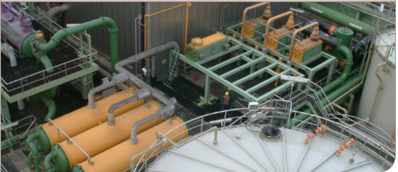
Three Compablocs (top right) with 50% higher capacity replaced three S&Ts (lower left) on half the footprint.

A major European chemical company increased production reliability by replacing shell-and-tube (S&T) condensers with Alfa Laval Compabloc condensers. Utilising only half the space of the old shell-and-tube installation, the Compablocs solved a corrosion problem and at the same time generated considerable savings in capital cost. “Big is not beautiful anymore at this site”, says the plant engineer.