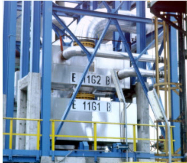
Two out of totally four horizontally mounted Compabloc in titanium used for vapour condensing in the atmospheric distillation tower.

exchangers. The Compablocs have now been in continuous operation for more than four years since commissioning in 1997. According to Mr. Ammar, the Senior Process Engineer of the refinery there has been no sign of decreased heat transfer or increase of pressure drops during this period and consequently there has been no requirement for service and maintenance of the Compablocs.